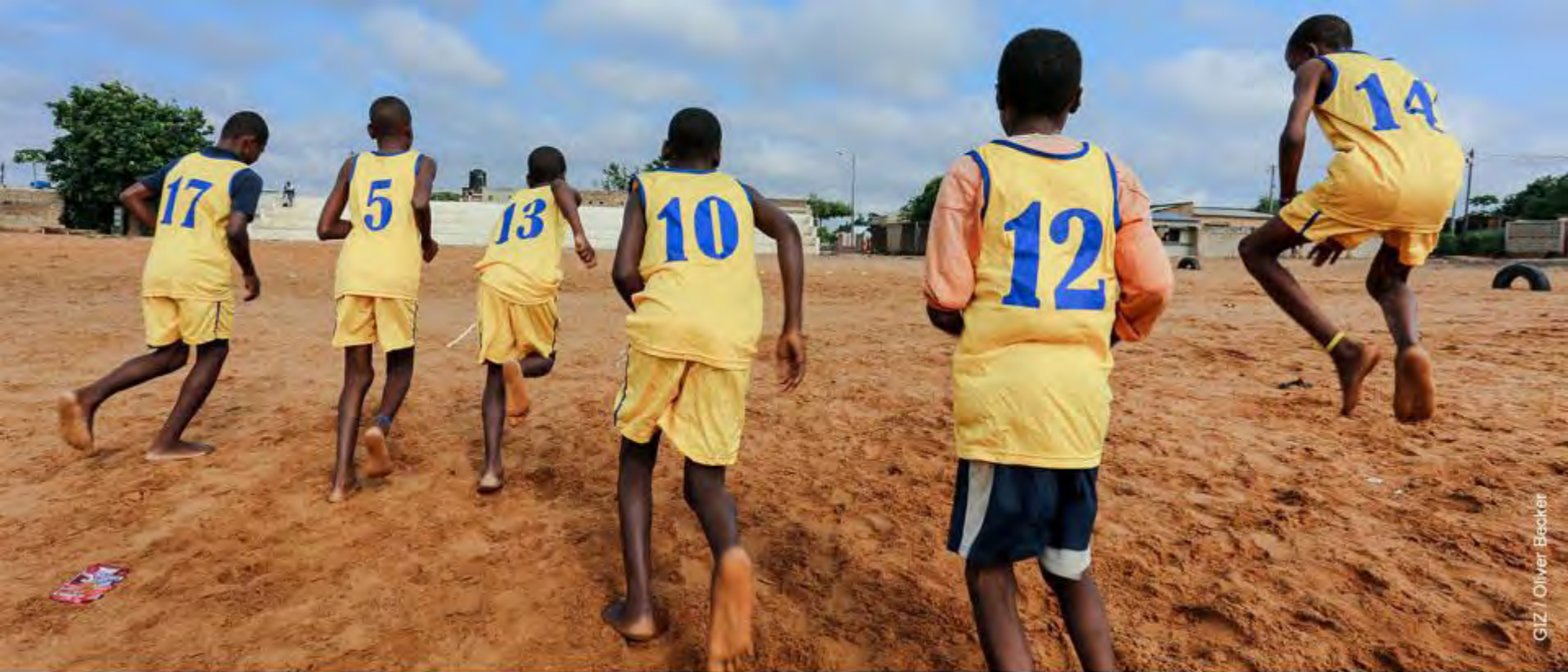
GIZ / Oliver Becker